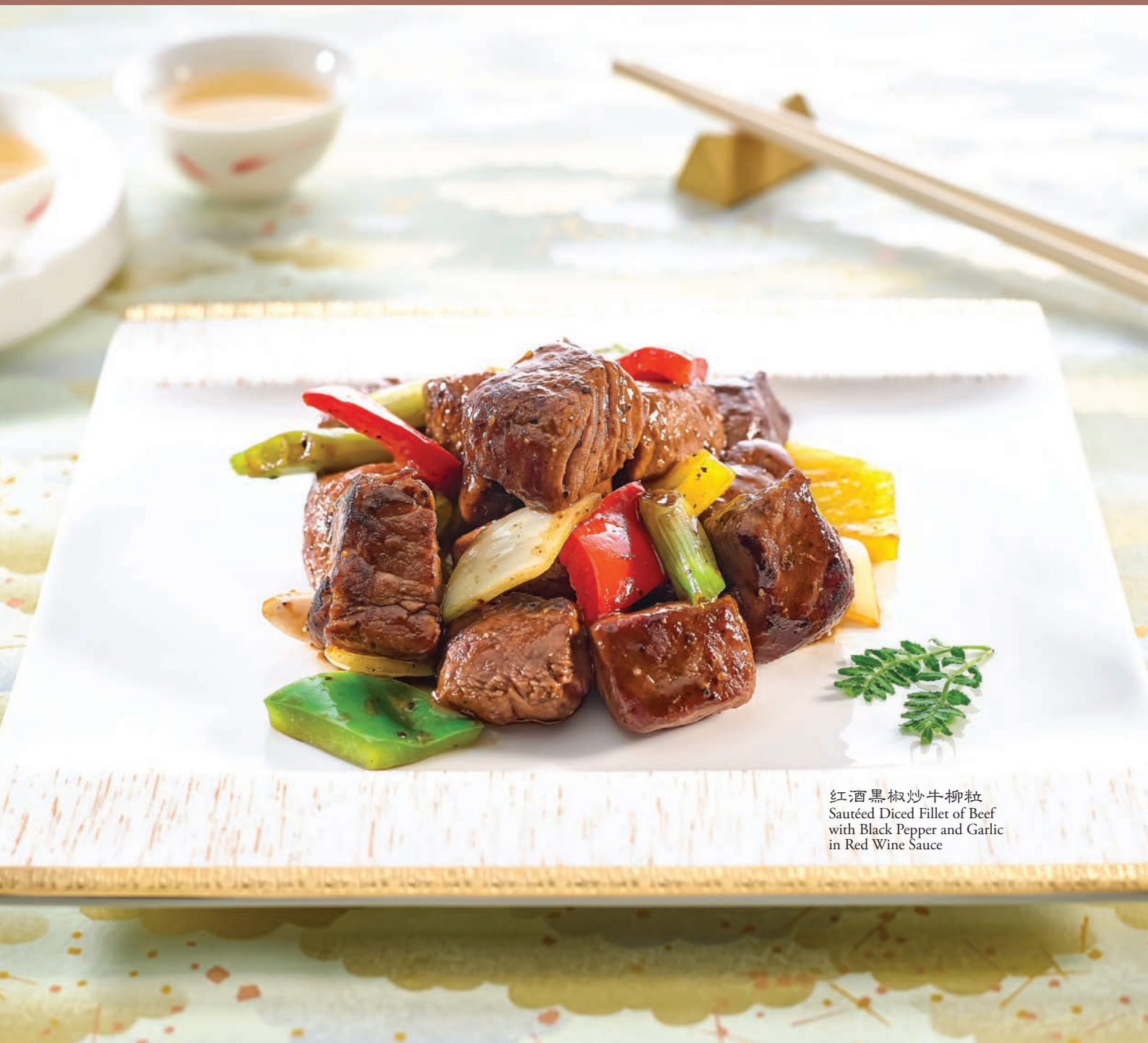
红酒黑椒炒牛柳粒 Sautéed Diced Fillet of Beef with Black Pepper and Garlic in Red Wine Sauce