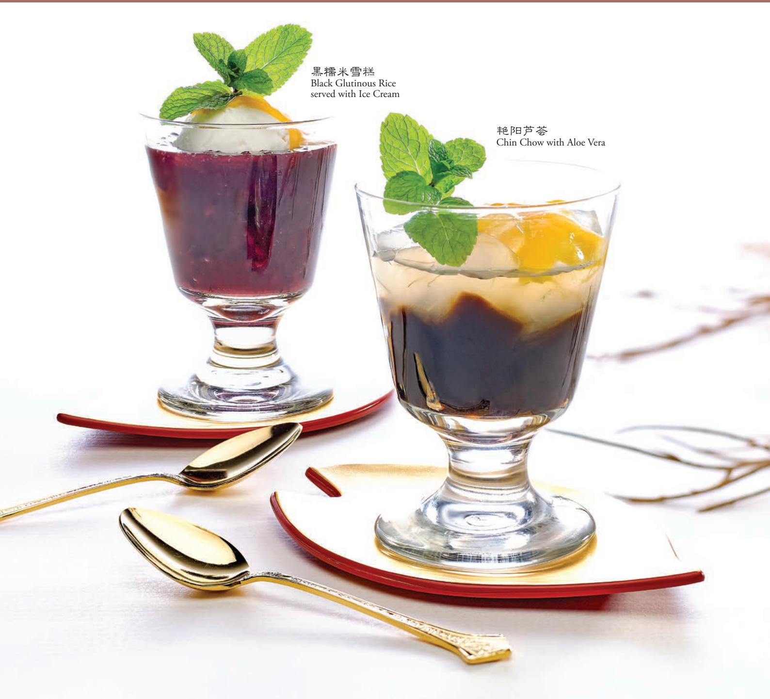
黑糯米雪糕 Black Glutinous Rice served with Ice Cream