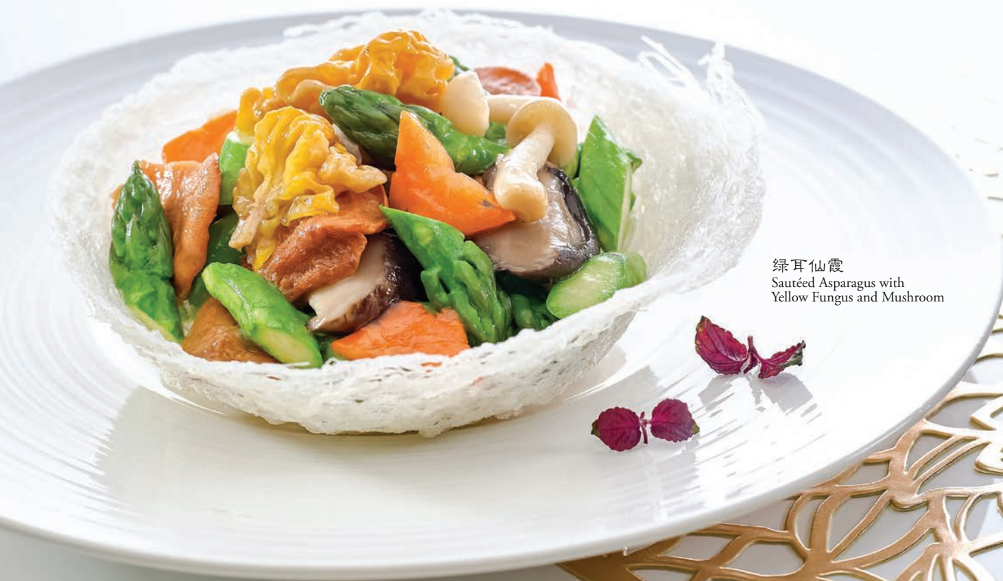
绿耳仙霞 Sautéed Asparagus with Yellow Fungus and Mushroom