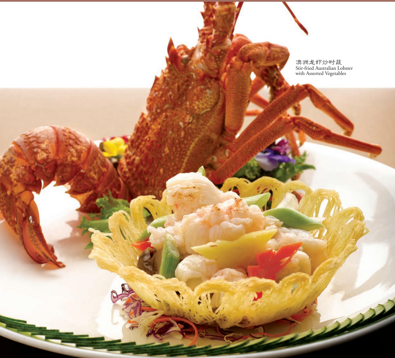
澳洲龙虾炒时蔬 Stir-fried Australian Lobster with Assorted Vegetables