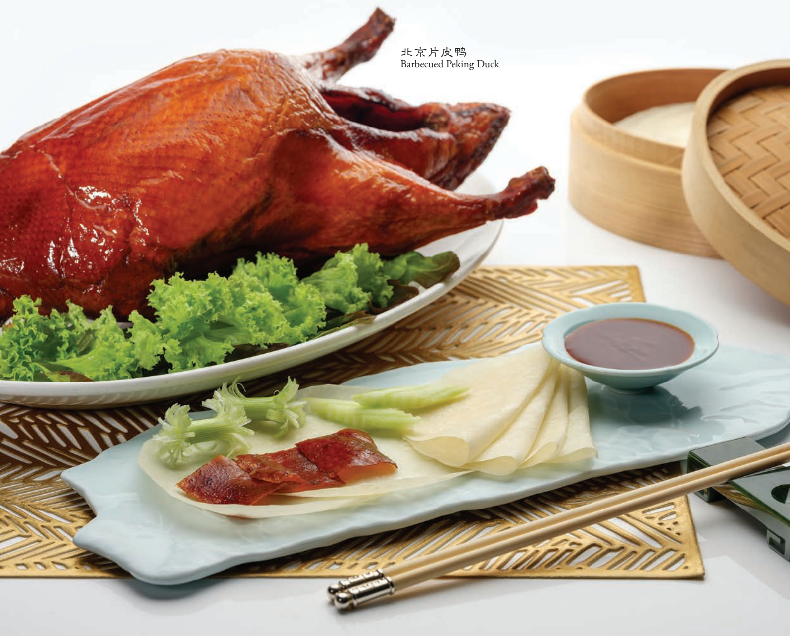
北京片皮鸭 Barbecued Peking Duck