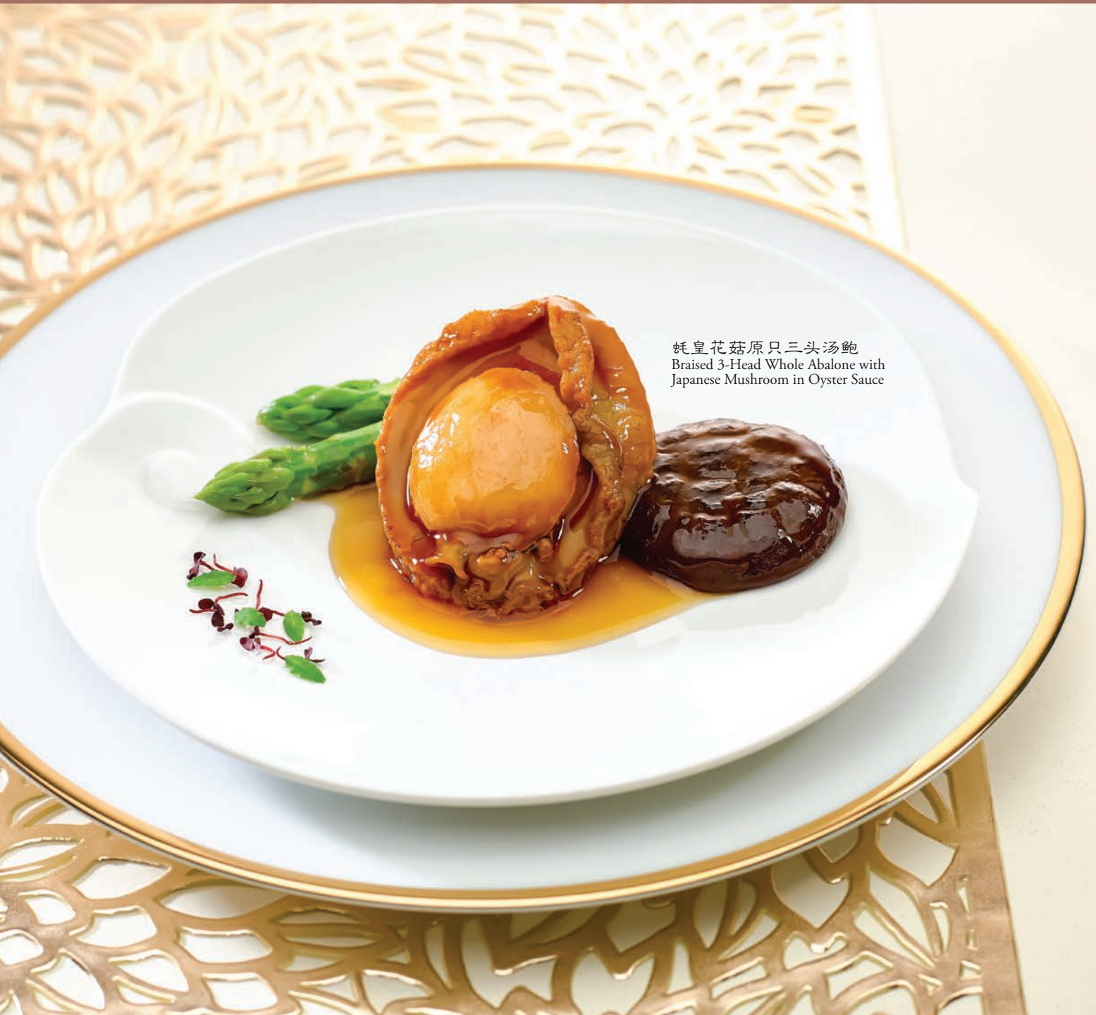
蚝皇花菇原只三头汤鲍 Braised 3-Head Whole Abalone with Japanese Mushroom in Oyster Sauce